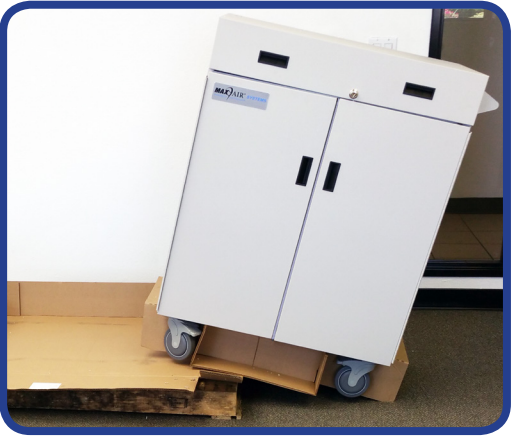
7. With a slight lifting motion on the Cart Moving Handle, pull the Cart safely off the pallet and the cardboard support between the Cart and pallet.

6. Unlock the rear wheels to allow the Cart to roll off the pallet. Push the locking lever forward (arrow).