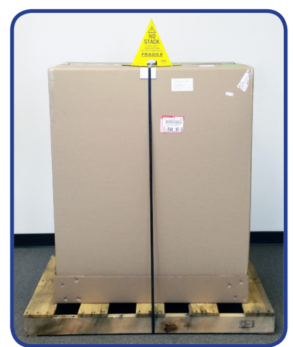
1. Safely cut and remove shipping straps.

Cart weight is approximately 160 lbs. Use proper precautions and follow OSHA safety standards.