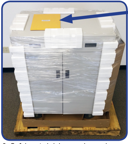
3. Safely cut shrink-wrapping and remove it and foam protectors from all around Cart.

4. Remove "Read-Me-First" envelope. Inside envelope are the Cart Keys and the Instructions For Use.