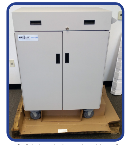
5. Safely break down the sides of the bottom box.