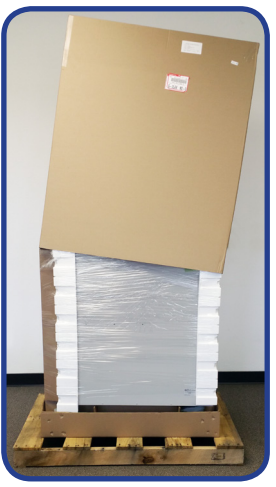
2. Lift top outer box up and off Cart.