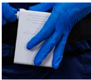
7. Connect Helmet Power Cord to Battery. Push Power Cord Connector into Battery Receptacle until Secure Connection audibly clicks.