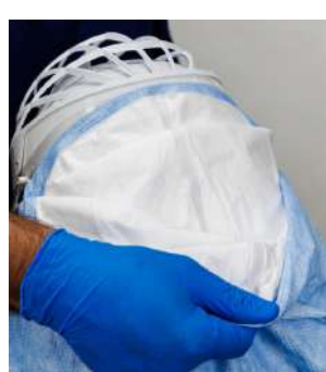
Grasp the back of the Hood Filter and begin to pull the Hood up and over the Helmet.