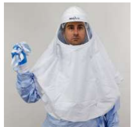
1. Untie both neck and body Ties, pull through their loops and discard appropriately.