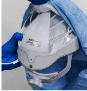
Continue pulling the Hood over the Helmet down to within about 1-2 inches from the top rear Helmet Snap.