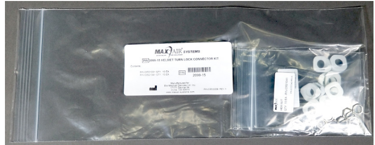
10 sets of Connector with Hex Nut