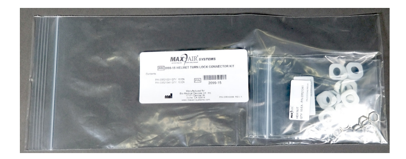
10 sets of Connector with Hex Nut