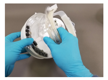
1. Remove the Helmet Liner.