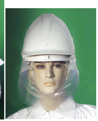
Fully donned Hard Hat System with Cuff and ANSI Lens.

Fully donned Hard Hat System with Shroud and ANSI Lens.